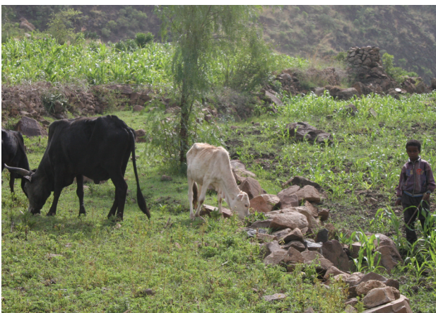
Livestock grazing as part of crop rotation.

Extensive farming helps reduce competition between people and farm animals for high quality grains and high-grade arable land. Intensive farming tends to lead to a greater amount of grain being used for animal feeds. This places animals in more, and direct, competition with people for scarce resources such as land, water and energy. Vast quantities of resources are used in livestock farming, including around one third of the world's cereal harvest (two thirds in the EU), reducing the resource base available for people.