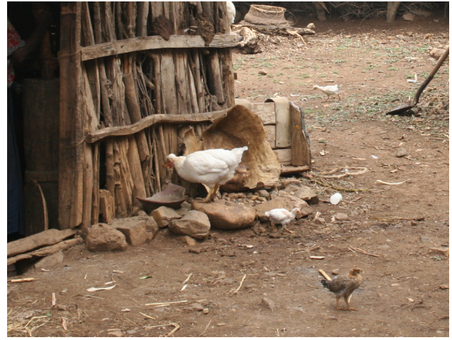
Caged hens rely on high-grade grains, whereas extensive hens can eat wastes and forage to supplement their diets.