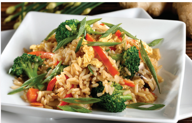
Balanced and healthy diets are possible for all.

The study finds that if global average yields rise only slightly from today, intensive livestock farming cannot achieve food security in 2050 in any of the diet scenarios, but when relying on extensively raised livestock, food security can probably be achieved in two diet scenarios. With higher yields, extensive livestock farming is still more likely to provide food security than intensive farming with grain-based animal feed.