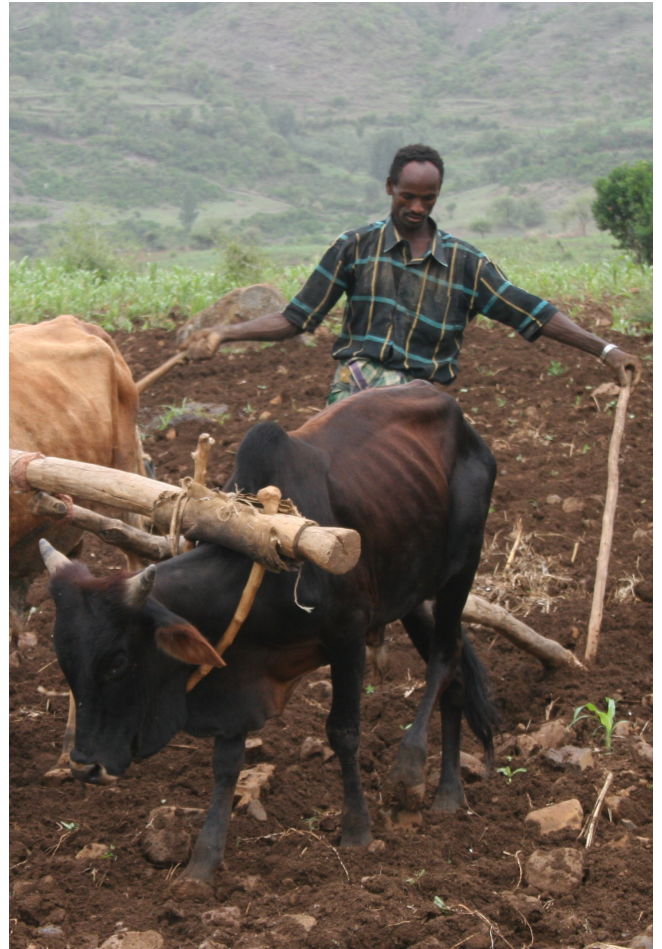
Livestock are vital for draught in many farms.